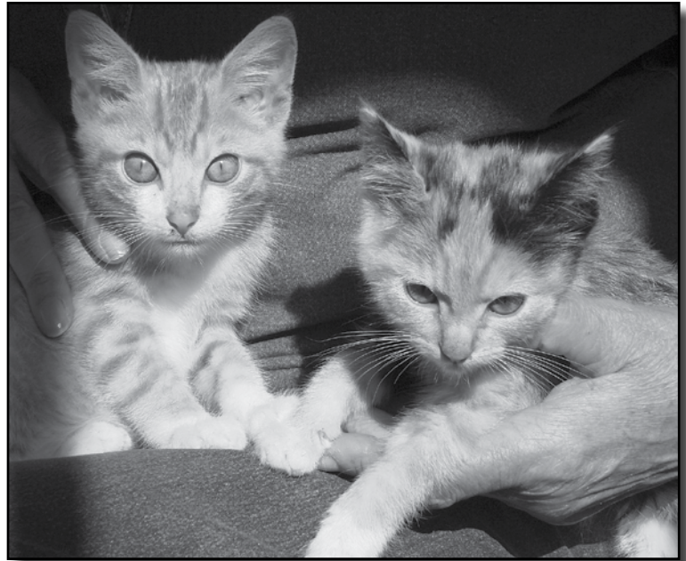
Cheddar and Brie