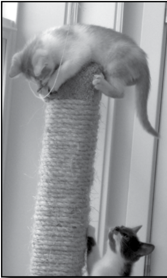
Shasta trailer alumni Agatha and Hercule